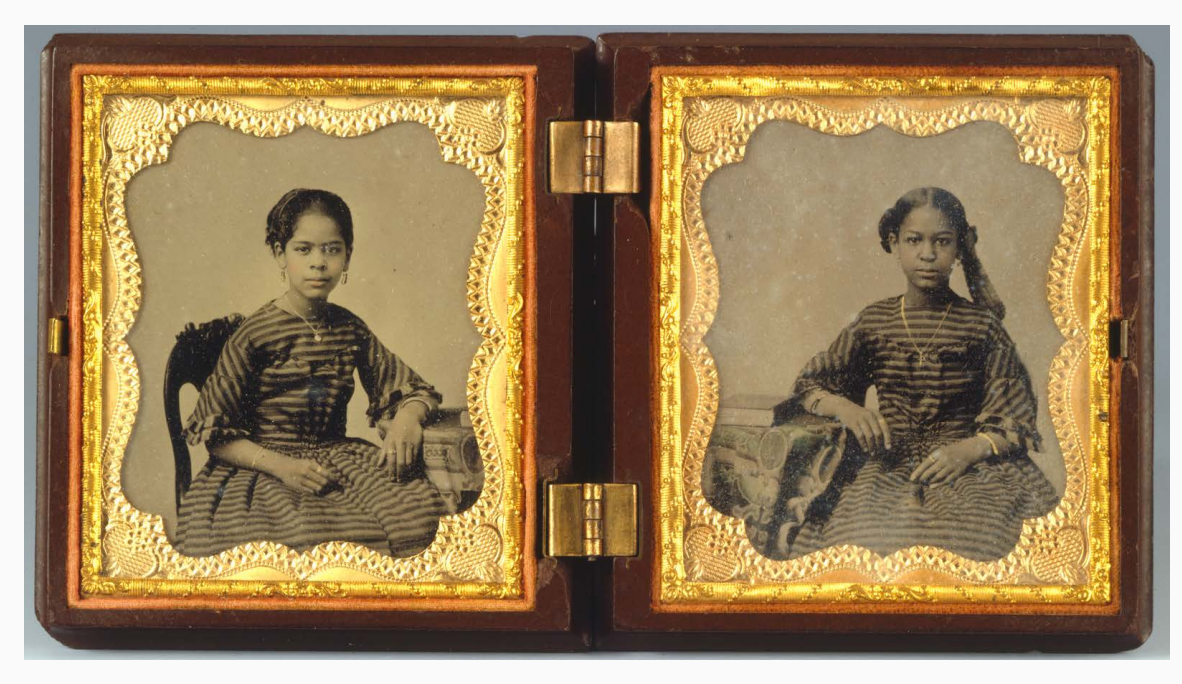
Maritcha Lyons and her younger sister Pauline. ca. 1860, Photographs and Prints Division, Schomburg Center for Research in Black Culture, The New York Public Library, Astor, Lenox and Tilden Foundations.

Park, north of the original site of Seneca Village. The Lyons family might have owned property in Seneca Village, which was one of the first free Black communities in New York before residents were displaced for the construction of Central Park. The Lyons family represents multiple generations of activism through their dedication to abolition, equal education, women's rights, and racial justice.